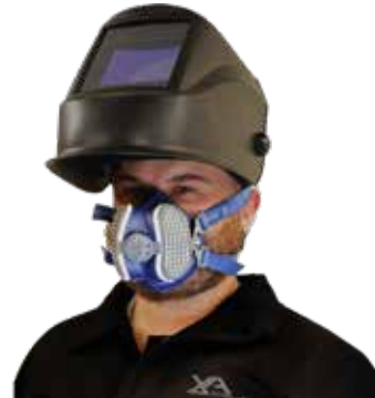
WELDING HELMET NOT INCLUDED