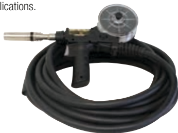
SUREGRIP SP24 200 AMP