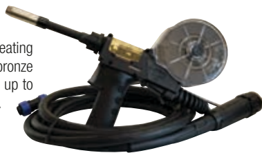
SUREGRIP SP15 150 AMP